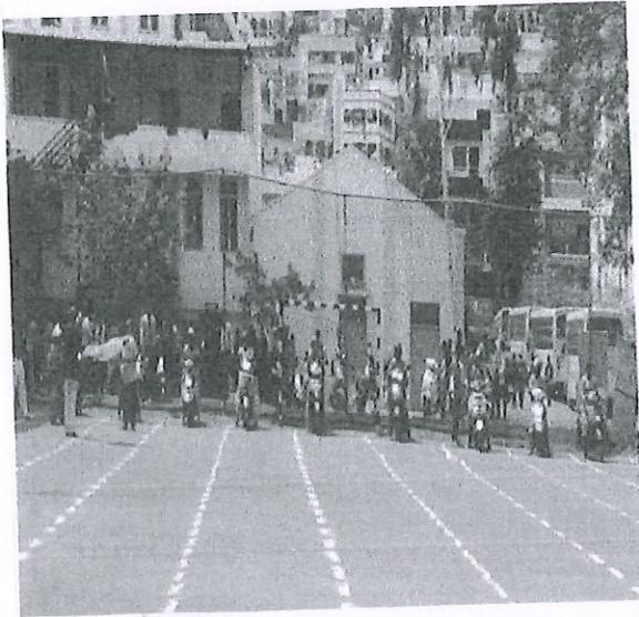
Slow Scooty Driving Competitions 3-3-2020